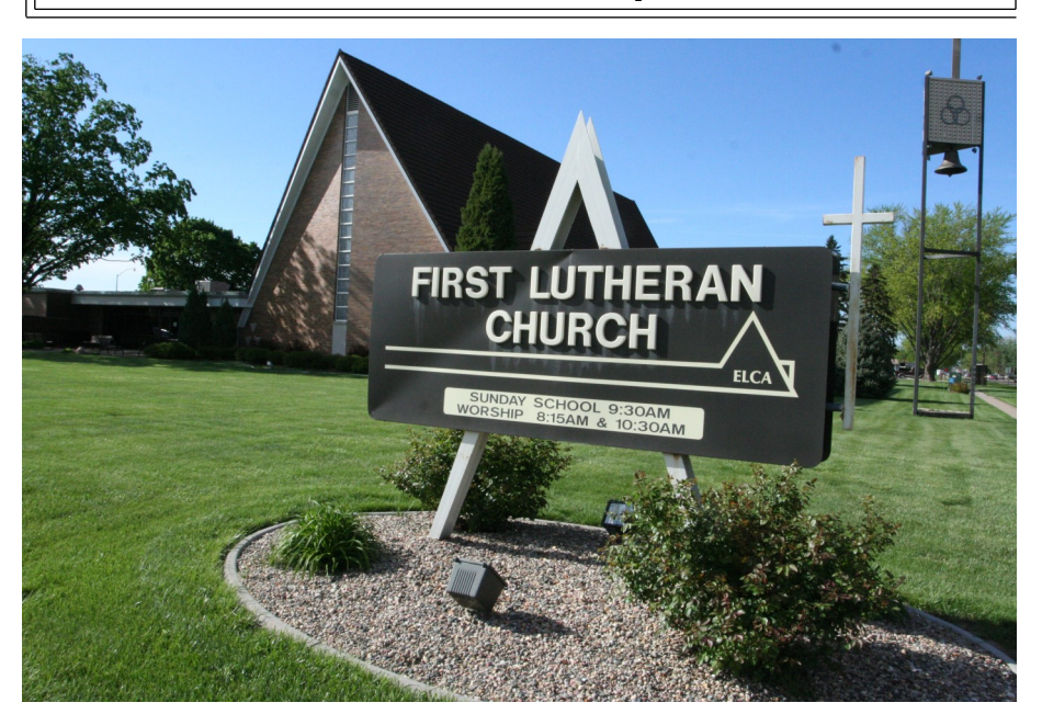
God's Work. Our Hands.