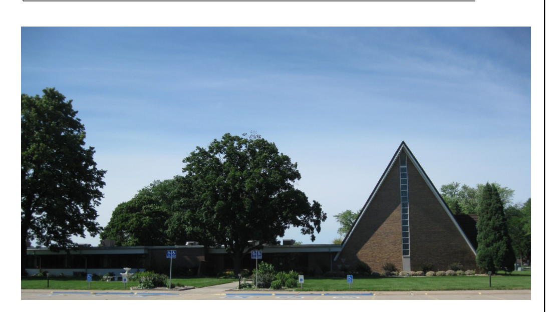
God's Work. Our Hands.